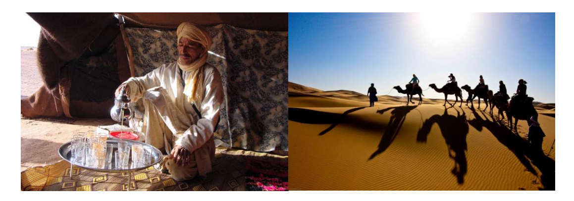
Hotel – Aubeger Du Sud

We spend a night in a Saharian traditional accommodation and enjoy the traditional Berber's cuisine.