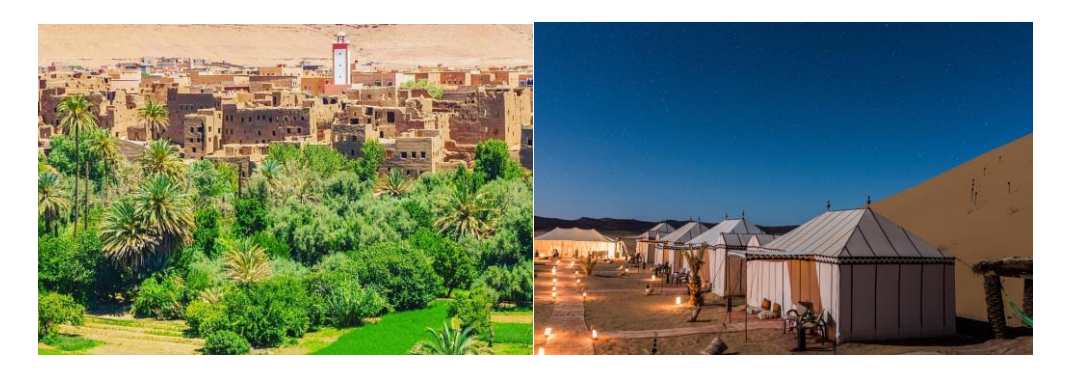
Day 5 – Sahara Desert Excursion