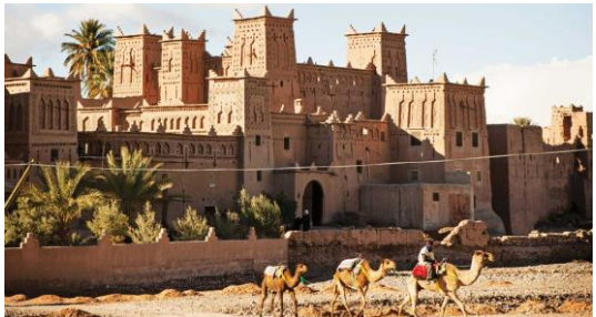
Hotel - Ksar El-Kabbaba

Skoura is the beginning of the route of the Thousand Kasbah. We start our morning on a guided walking tour for the Palm Groves, with the visit to the beautiful 17th century Amerhildl Kasbah, Dar Ait el-Mati and Ait Ben Abou built in 1863, the oldest with 6 storey height of 25 meters, now turn into short stay accommodation. Guest can opt for the walking tour or a half day horse riding tour. If time permits than we drive about 25 Km to a small village in Toundoute to immersed at the Berber daily life and trek a bit for the Kasbah of Sidi M'barek