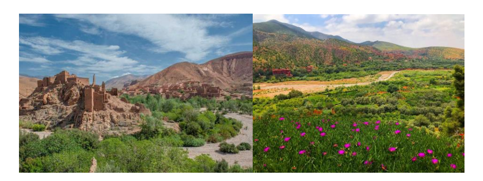
Day 4 – Tinghir – Tinejdad (56 Km, 1 Hrs 15 Min) – Goulmima – Camp (145 Km, 2 hrs 30 Min) (B/L/D)

In the morning we will take a walk at old Glaoui's Kasbah and you will have a great panoramic views or the area. We enjoy the old Jewish quarters, Ait El Haj Ali and visit a local small museum for collection of the old photography of the community.