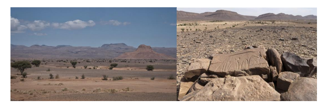
Day 7 – Zagora – Agdz – Ouarzazate (162 Km, 3 Hrs) (B/L/D)

After breakfast we will drive to Tamegroute for the famous Sufi zaouia of Naciria which is the centre of Islamic education founded in the 17<sup>th</sup> century. It house the most extensive and priceless Quranic manuscript library. We then proceed to visit the famous green glazed pottery typical of Tamegroute ceramic. We continue to Quarzazate, the route of salt, gold and salves with caravan using the Transsaharan from ancient Mauritania and heading to Venice.