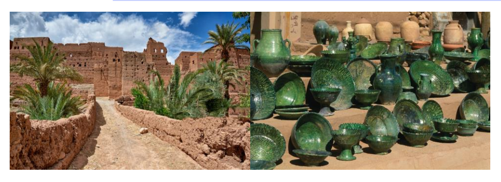
Day 8 - Ouarzazate - Marrakech (194 Km, 4 hrs)